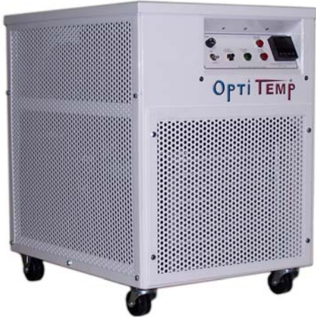
Model OTC-.5W-OTC-.75W Shown

A Partial List of Process Cooling Markets: Aero. & Defense, Digital Printing, Food & Beverage, Mobile Imaging, Plastics Photonics, Research, & Semi-Conductor.